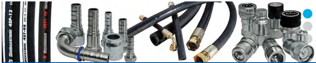
HYDRAULIC HOSES AND FITTINGS