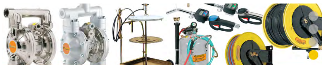
INDUSTRIAL EQUIPMENT AND TOOLS