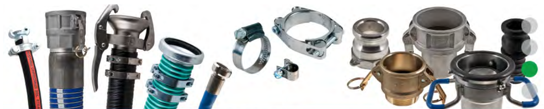
INDUSTRIAL HOSES AND FITTINGS