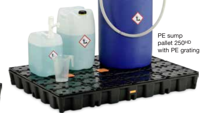
PE sump pallet 250 HD with PE grating