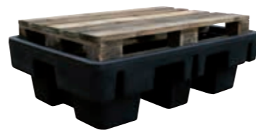
PE sump pallet 230/2