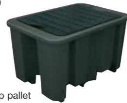
PE sump pallet 240/1