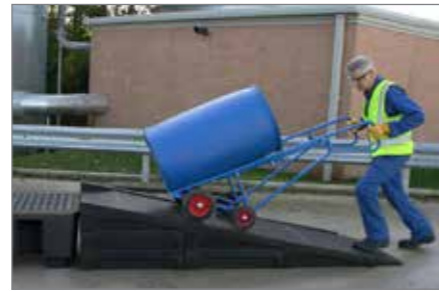
Accessory: access ramp for PE sump pallet 240