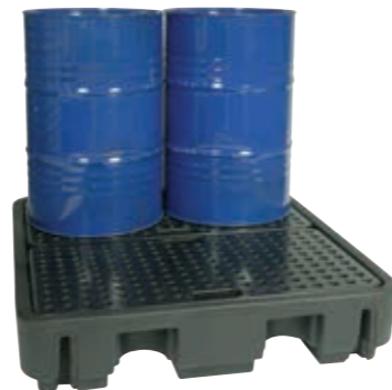
PE sump pallet 240/4