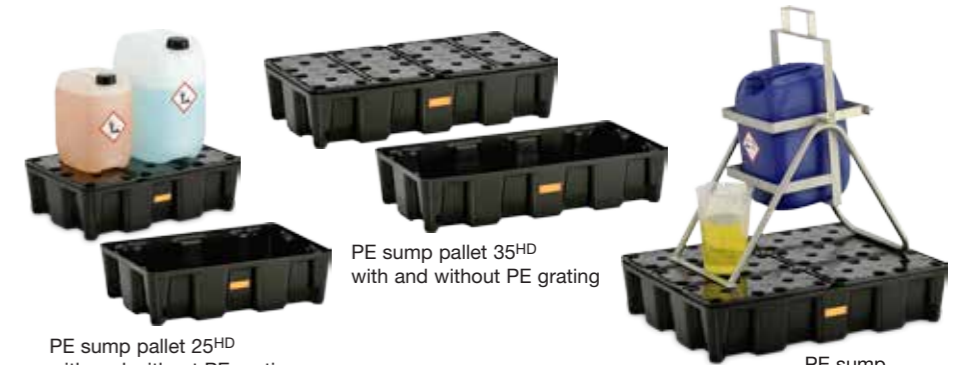
PE sump pallet 25 HD with and without PE grating