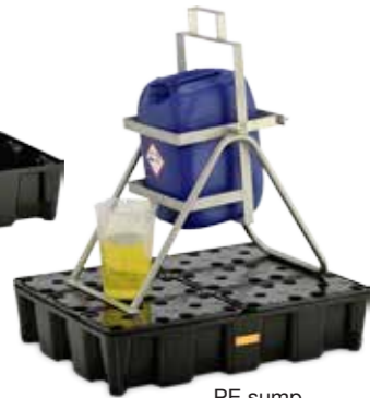
PE sump pallet 60 HD with PE grating