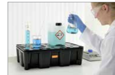
PE sump pallet 25 HD with PE grating as laboratory tray