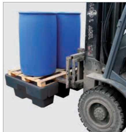
PE sump pallet 230/2