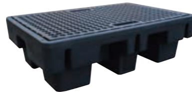
PE sump pallet 230/2 with PE perforated plate (accessory)