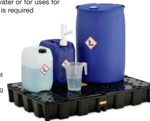
PE sump pallet 120 HD with PE grating