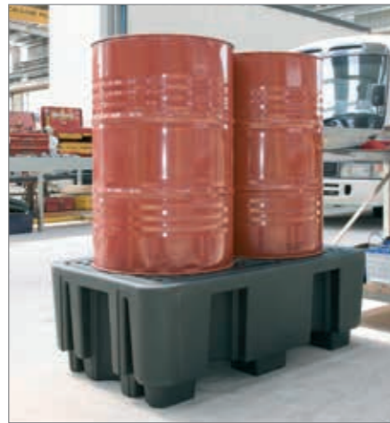
PE sump pallet 240/2