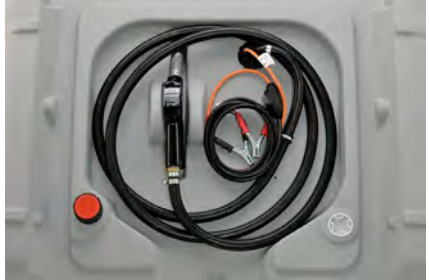
Pick-up 210 L with submersible pump CENTRI SP30 12 V