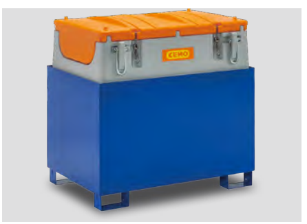
See catalogue page 153 for suitable steel bund SW 600/2