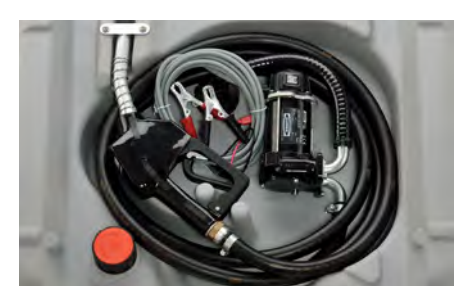
210 L with pump 12 V