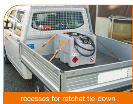
Integral recesses (125 L, 200 L 210 L and 440 L) and lashing eyes (460 L, 600 L, 850\,L/100 L and 980 L) to allow immobilisation with a ratchet lashing strap during transportation.