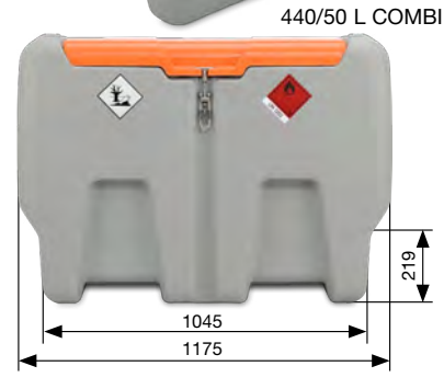
440 L and 440/50 L