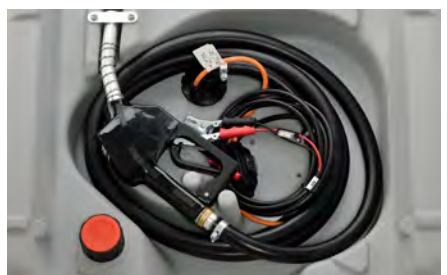
210 L with CENTRI SP30 12 V and CAS battery

without hinged lid: order no. 10978 with hinged lid: order no. 10981