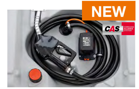
210 L with CENTRI SP30 18 V and CAS battery