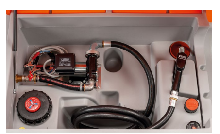
Basic version with Cematic Duo. 24/12 V