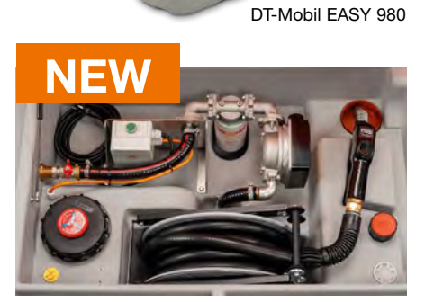
DT MOBIL Easy 980 Premium with CENTRI SP80

DT MOBIL Easy 980 Basic with CENTRI SP80