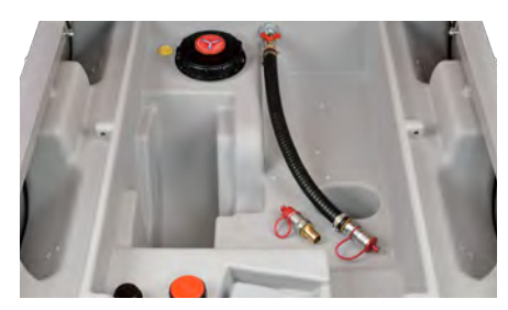
DT-Mobil EASY 980 without pump, with quick coupling