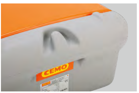
Integral recesses for fastening with tie-down straps