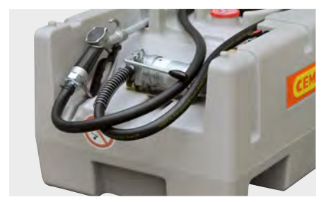
125 L with hand pump