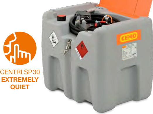
210 L with 12V submersible CENTRI SP30 12 V and hinged lid