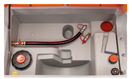
Version without pump with quick coupling