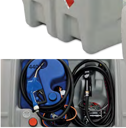
440/50 L COMBI with pump 12 V