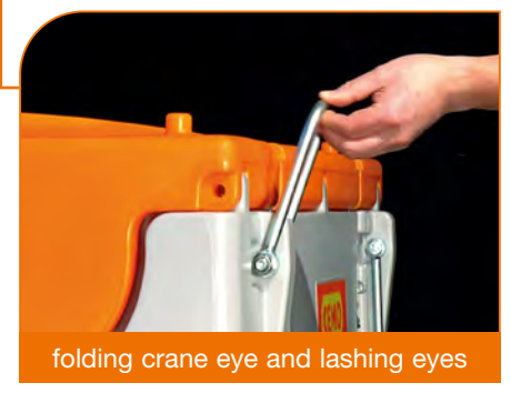
The folding crane and lashing eyes (460 L, 600 L, 850 L/100 L and 980 L) make it easier to secure the load in the prescribed manner, and serve at the same time as fastening eyes if the device is lifted by crane.