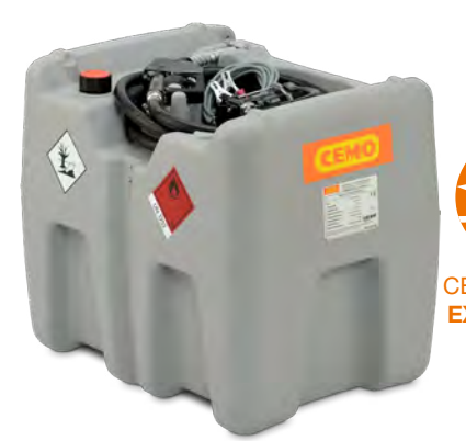
210 L with pump 12 V