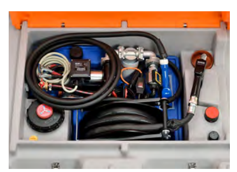
DT-Mobil Easy COMBI 850/100 Premium