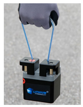
Li-Power-Block with rope loop for easy hanging and carrying