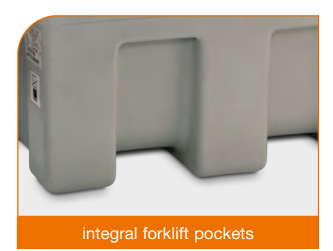
The integral forklift pockets make handling easier when the tank is full.