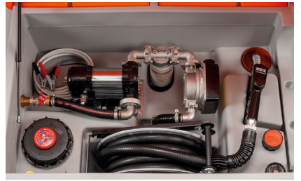
Premium version with Bipump, 12 V