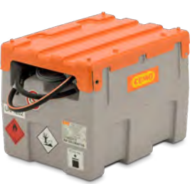
DT-Mobil EASY 200 L with electric pump, automatic nozzle and hinged lid