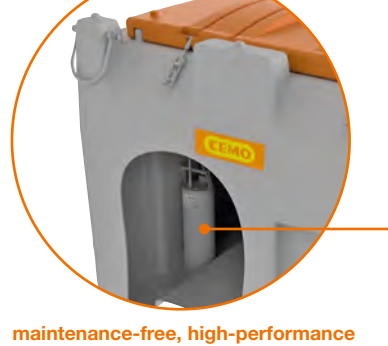
submersible pump CENTRI SP80 AC, 230 V

DT MOBIL Easy 980 Basic with CENTRI SP80