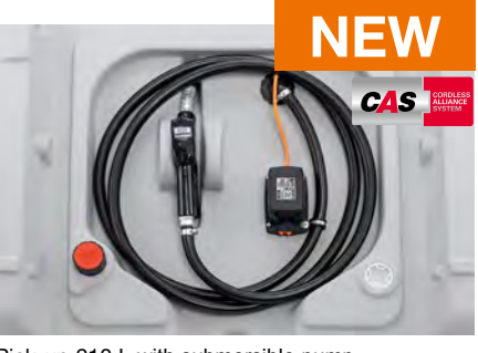
Pick-up 210 L with submersible pump CENTRI SP30 18 V and CAS battery