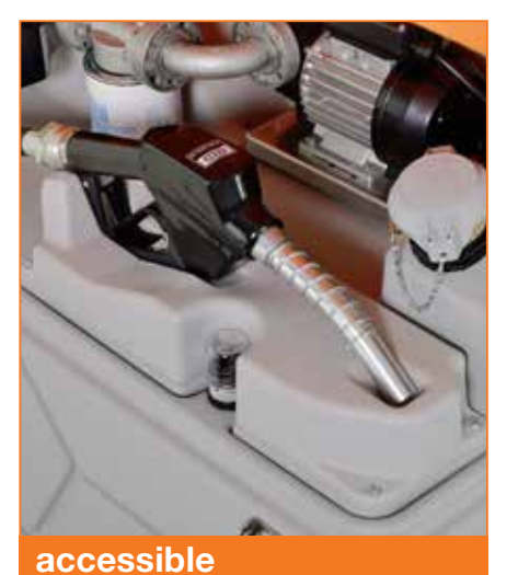
Integrated nozzle holder keeps things in place.