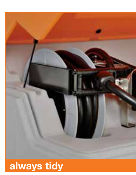
The automatic hose reel helps you keep 8 m of hose in order.