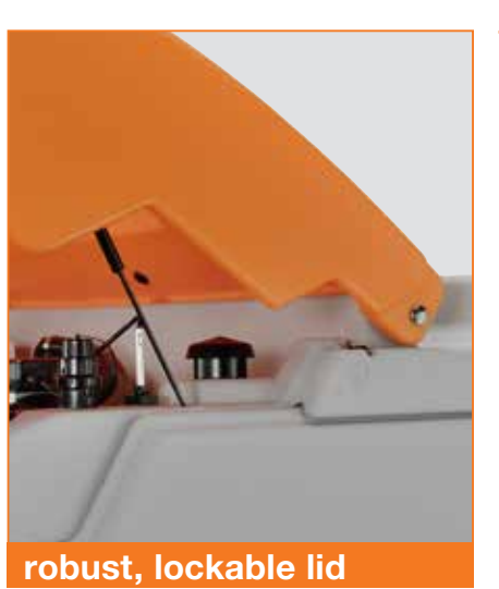
Lockable lid secured by toggle latches. Opens upwards on supporting gas struts to allow access from three sides and plenty of light to see what you're doing.