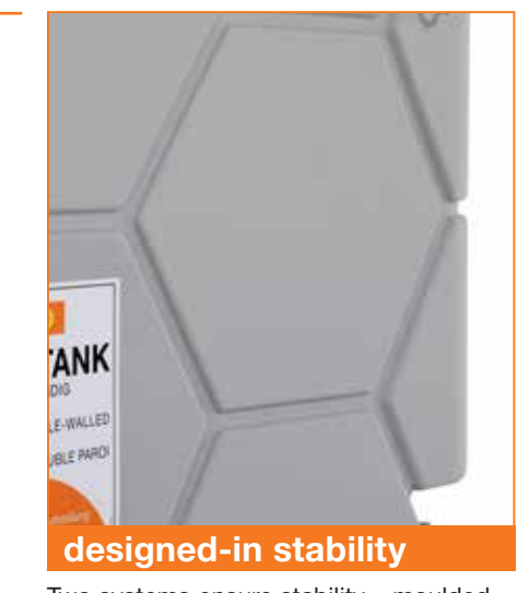
Two systems ensure stability – moulded hexagonal matrix for integral polymer strength, supported by twin steel bands at the points of greatest load. Reduces movement and increases service life.

Ü-mark shows compliance with German building standards that insist on a minimum 25-year service life, full load bearing capacity and 30 minutes fire resistance. CE-mark shows compliance with BS EN 13341:2005 & A1:2011 standard for above-ground polyethylene oil tanks.