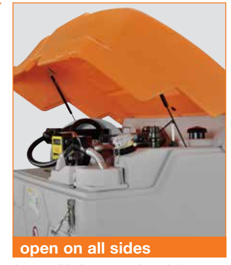
An open lid gives you unimpeded access to all components from three sides.