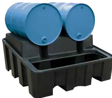
PE filling station 450 l