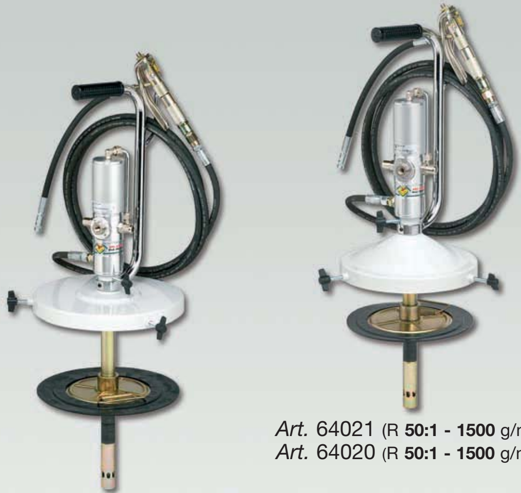
Art. 64021 (R 50:1 - 1500 g/min) Art. 64020 (R 50:1 - 1500 g/min)